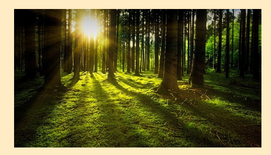
600,000,000 Trees chopped down to make cigarettes.