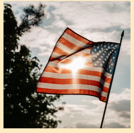
MEMODIAL DAY is shout

In modern times, the president lays a wreath at the Tomb of the Unknown Soldier at Arlington National Cemetery to observe this day.