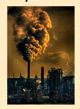
84,000,000 Tons of CO2 Emissions released into the air raising global temperatures.